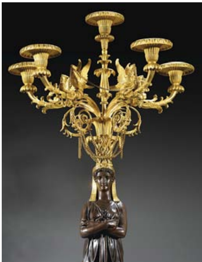
A closer view of one of the candelabara

On 26 June, in Paris, Sotheby's offered a silver plate engraved with the arms of Napoleon. It was made by Martin-Guillaume Biennais, one of Napoleon's favorite craftsmen, between 1809 and 1815.