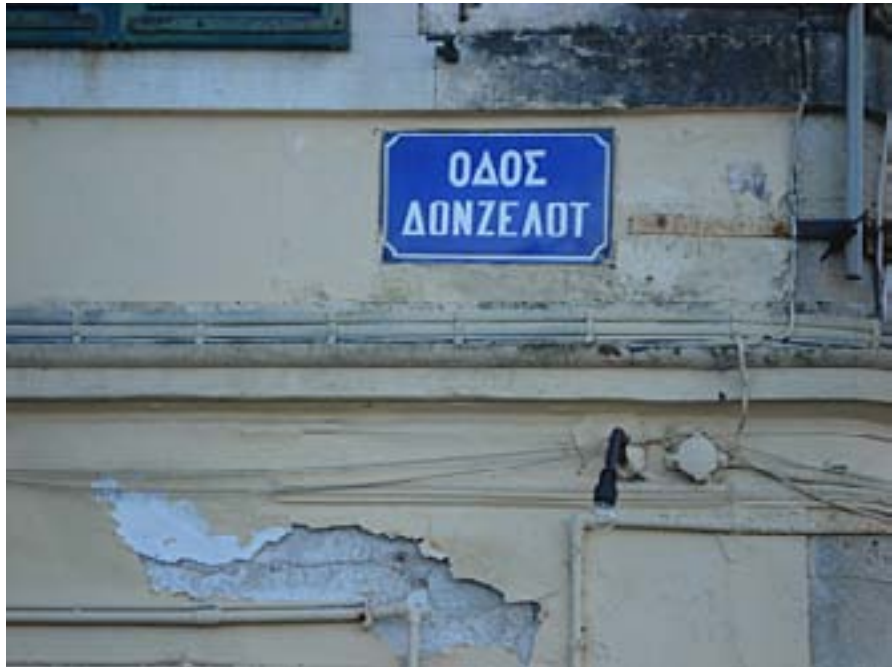
Donzelot Street. Thomas took some pictures of that street in modern Corfu.

This incensed Gore: 'The flag of your rightful monarch,' he wrote to Donzelot on 3 May, 'was first raised by your own citizens in Bordeaux; only you continue to fly the flag of the dethroned ruler of revolutionary France... The tricolor has now no official or legal status; any hostili-